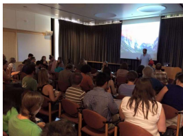
This month's Internal Perspective is about the CMSI Graduate Student and Postdoc Symposium! Come read our latest post here .